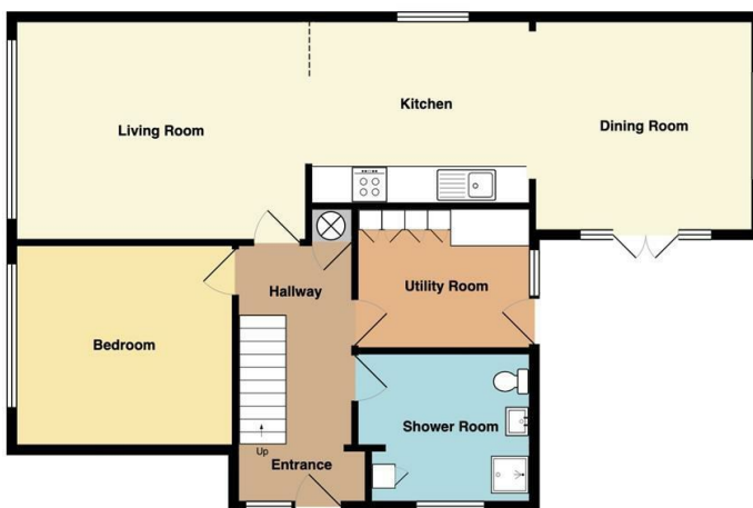
1st Floor Area (approx): 34.2 m 2 ... 368 ft 2